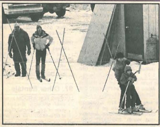
Sometimes getting up the hill requires a little help from your friends.