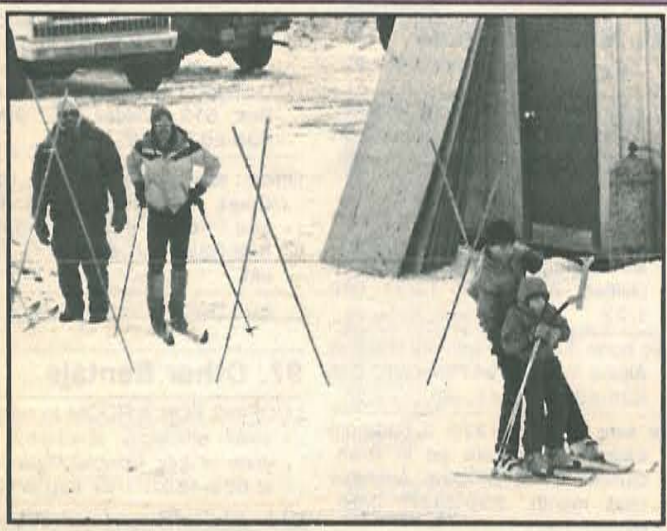
Sometimes getting up the hill requires a little help from your friends.